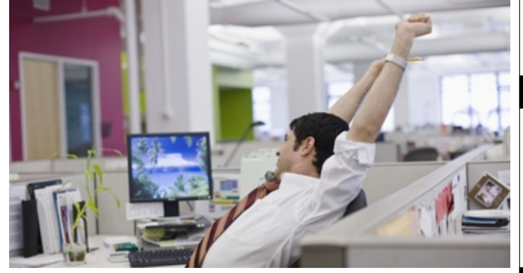
Even just a few minutes at work can help turn bad habits into good ones.